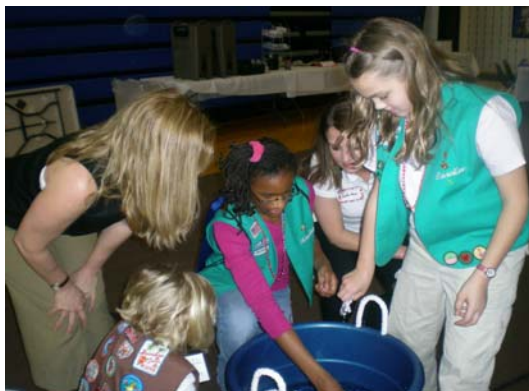
Girls Scouts participate in KEG's hands on activity "boat float"

Do you ever wonder what makes you unique and what inspired you to choose the career path you chose?